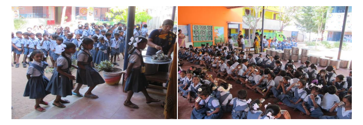
HAND WASH & NOON MEAL TAKEN BY CHILDREN IN SCHOOL